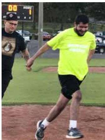
Running the bases

In these photos, clients and their families enjoyed a game against Southern Legacy Wrestling - http://www.slwpro.com/