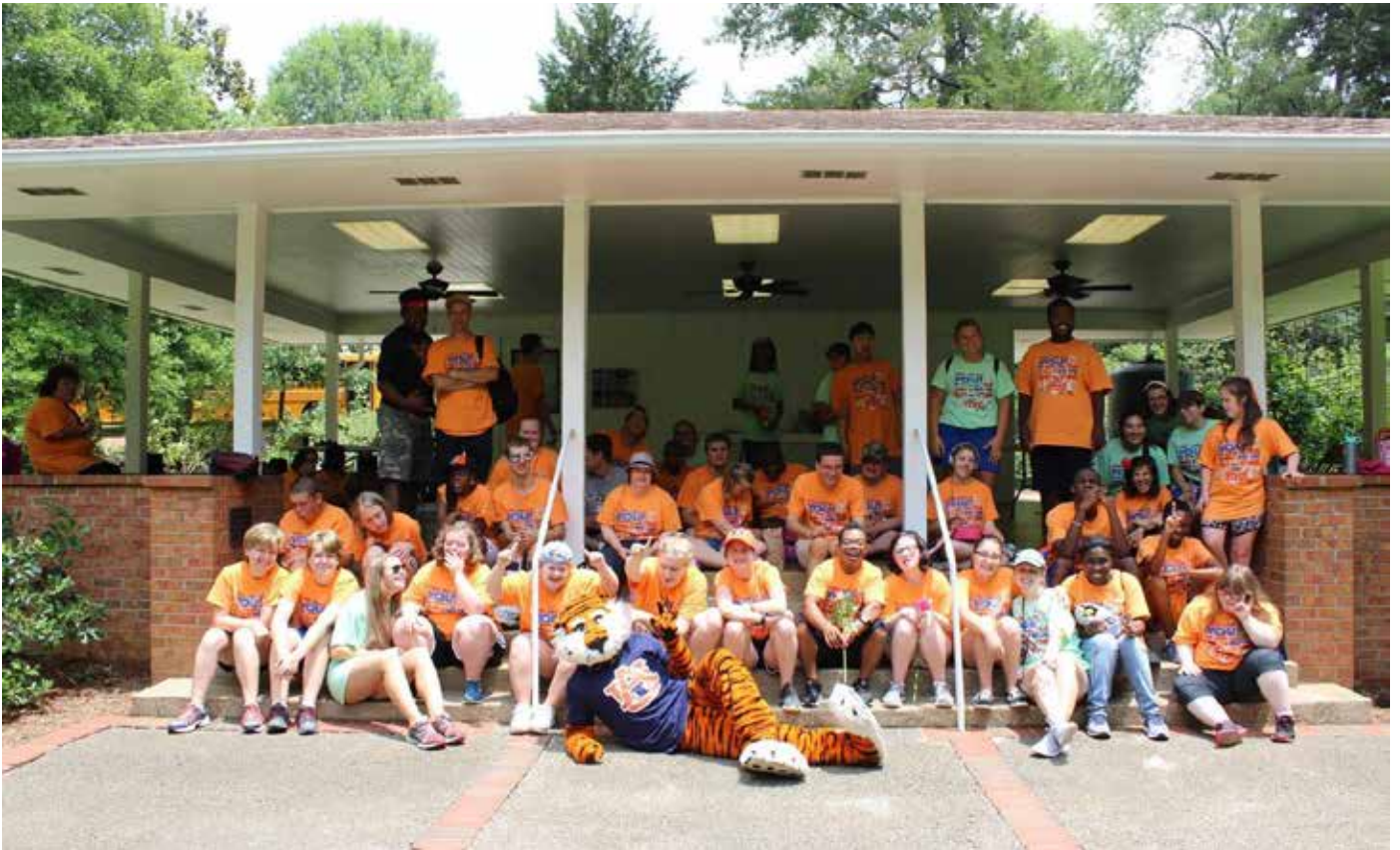
Auburn's Summer Therapeutic Camp spending the day with Aubie at the Davis Arboretum.