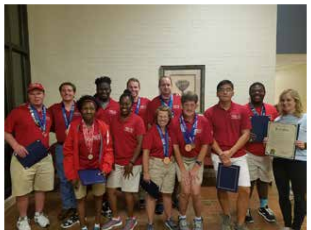
Special Olympics National Team from Lee County being honored at Auburn City Council meeting following their success at National Games in Seattle, WA.