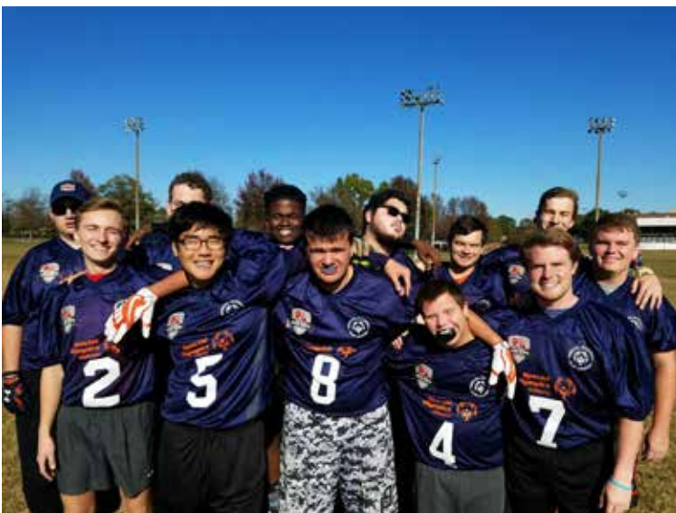
Lee County Special Olympics Flag Football Team celebrating their win against Tuscaloosa in the 2017 Special Olympics Iron Bowl.