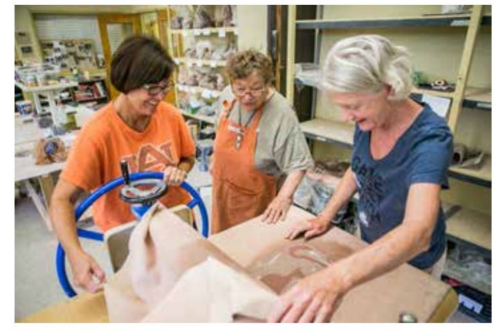
The Potters of Rocky Brook