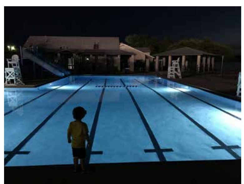
Checking out the new LED pool lights at one of the City of Guntersville Parks and Recreation Department's pools.