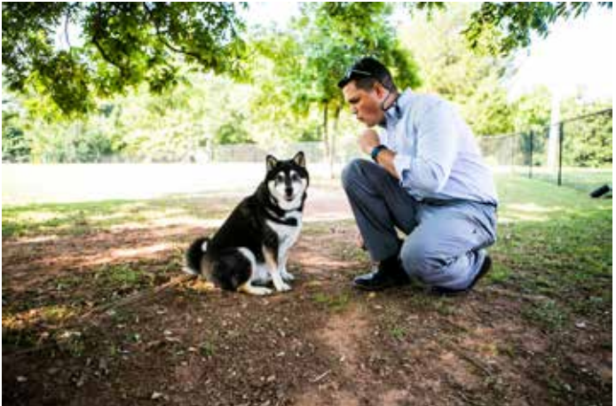
Opelika's Floral Dog Park