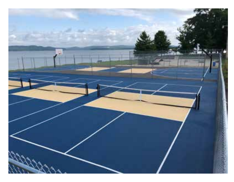
Fantastic shoreline venue for pickleball, basketball, and skate park located at the City of Guntersville Parks and Recreation Department Civitan Park.