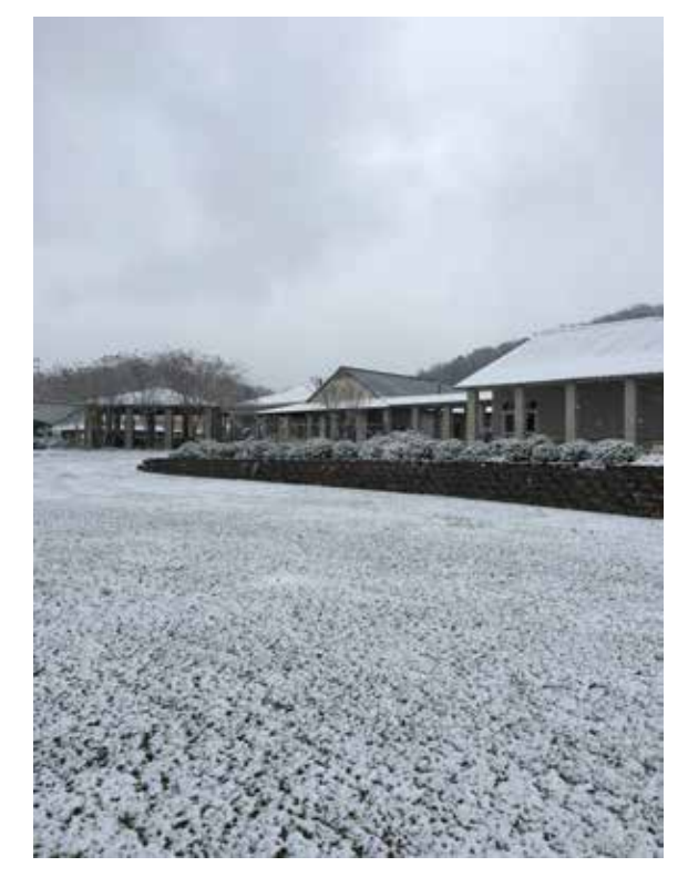
Light dusting of snow behind the City of Guntersville Senior Center.