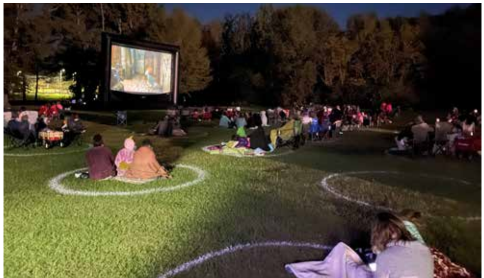
Campers enjoy swimming at Andrew Belle Pool